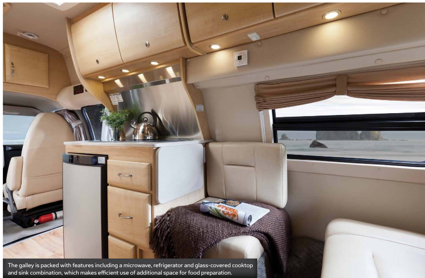
The galley is packed with features including a microwave, refrigerator and glass-covered cooktop and sink combination, which makes efficient use of additional space for food preparation.