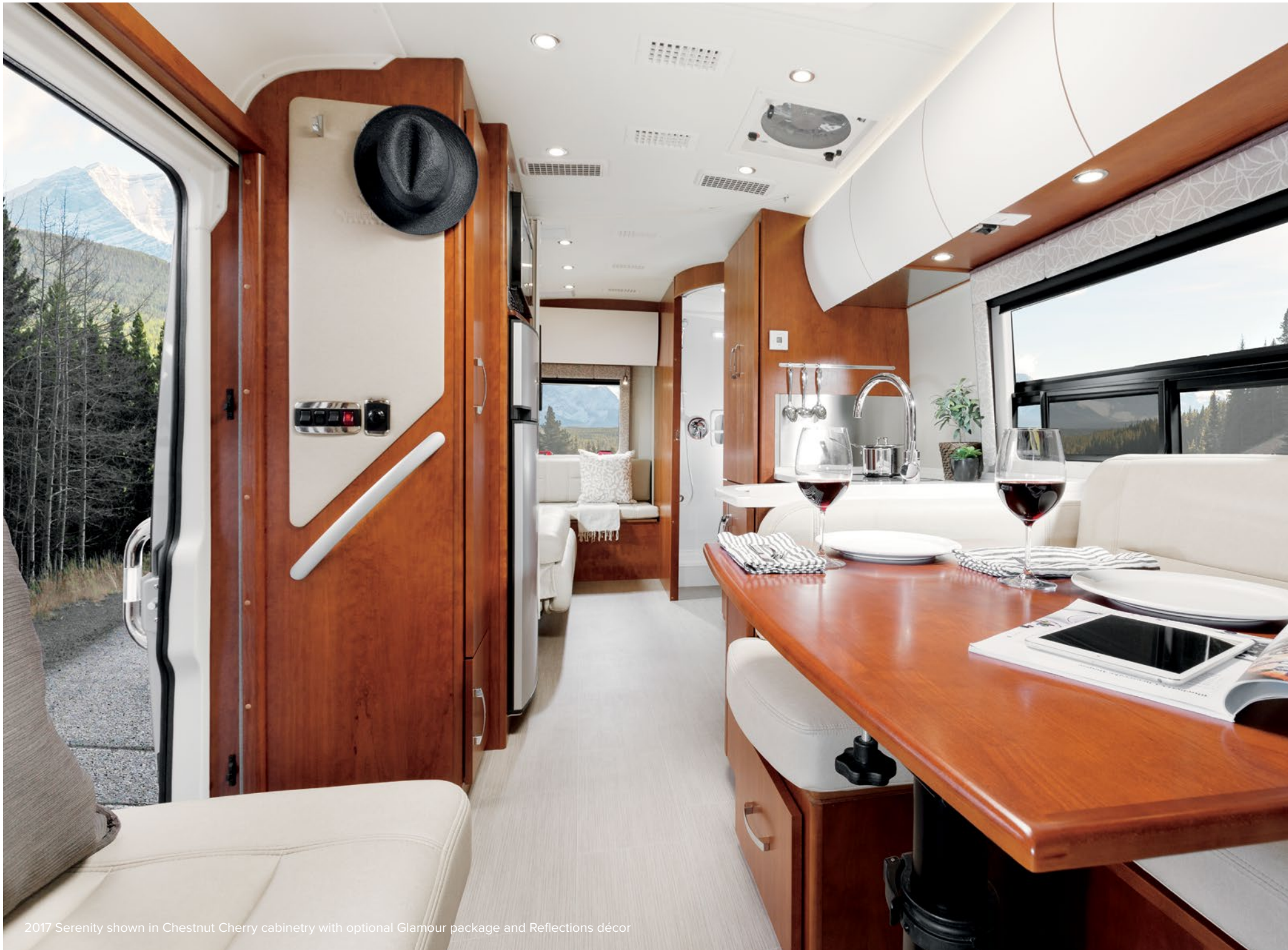
2017 Serenity shown in Chestnut Cherry cabinetry with optional Glamour package and Reflections décor