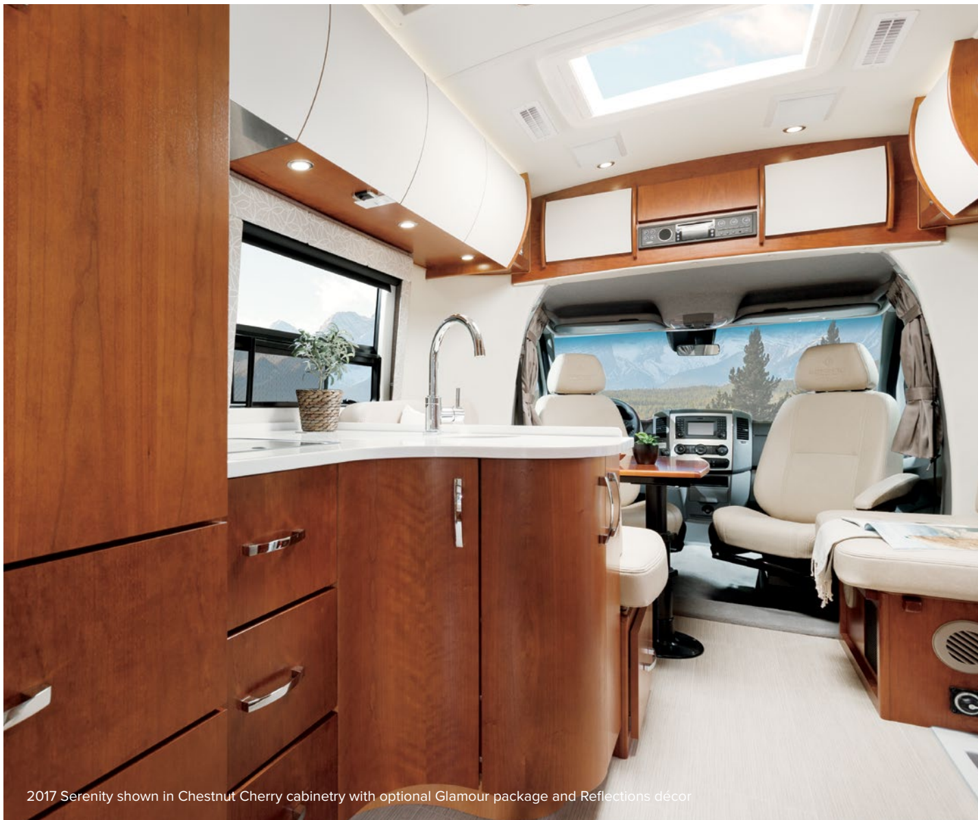
2017 Serenity shown in Chestnut Cherry cabinetry with optional Glamour package and Reflections décor