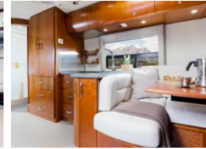
Chestnut Cherry Available w/ Glamour Package 2016 Model Shown