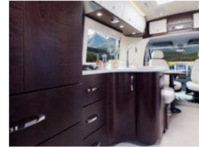
Espresso Brown Glamour Décor Package 2016 Model Shown