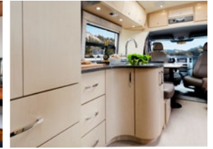
Sierra Maple Available w/ Glamour Package 2016 Model Shown