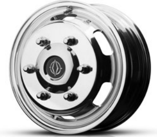
Alcoa Dura-Bright® Aluminum Wheels Optional - All 6 Wheels