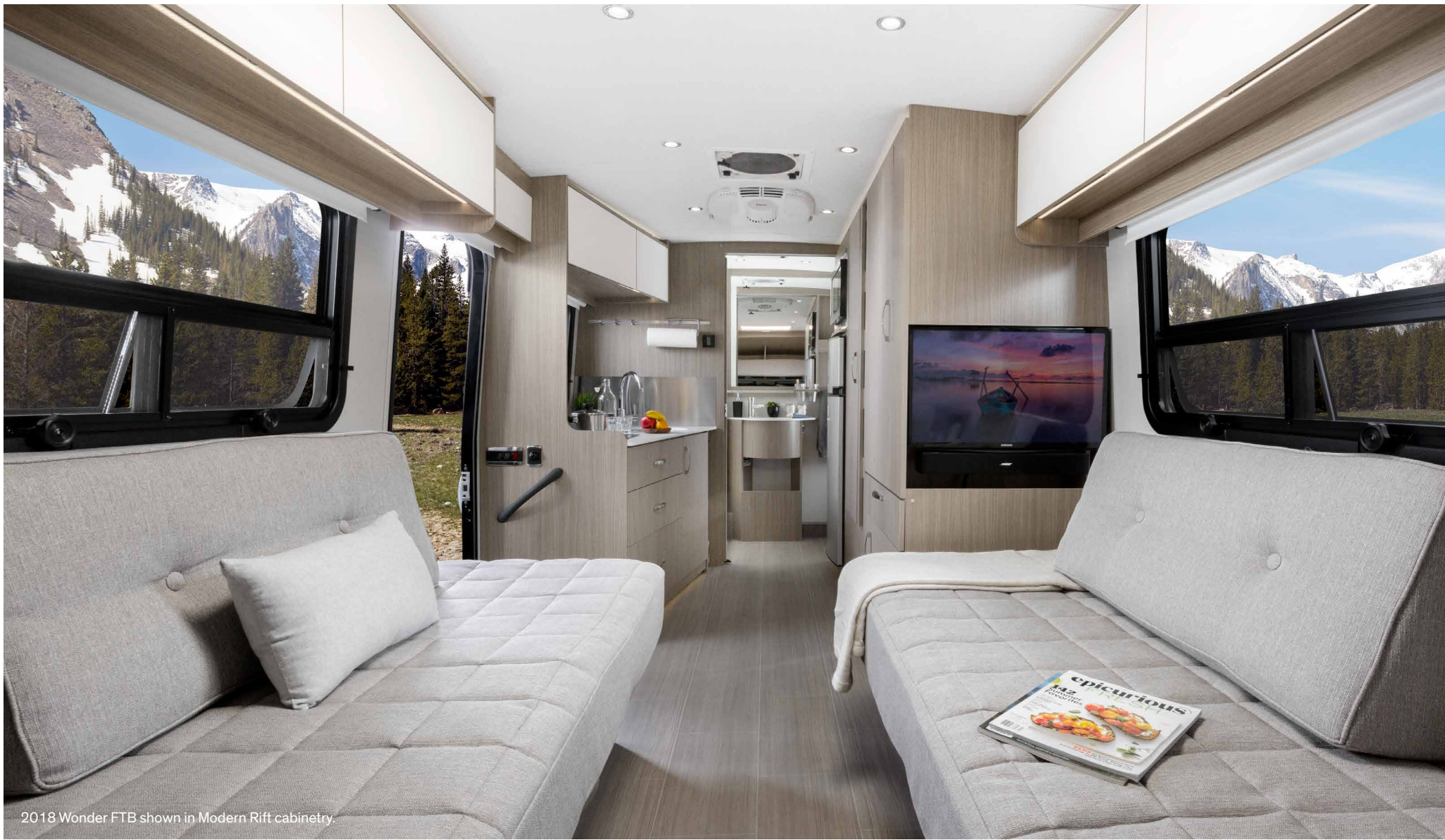
2018 Wonder FTB shown in Modern Rift cabinetry.