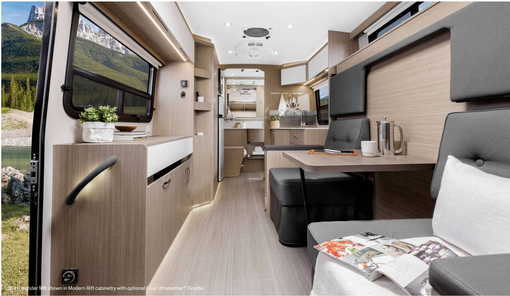
2018 Wonder MB shown in Modern Rift cabinetry with optional Coal Ultraleather® Dinette.