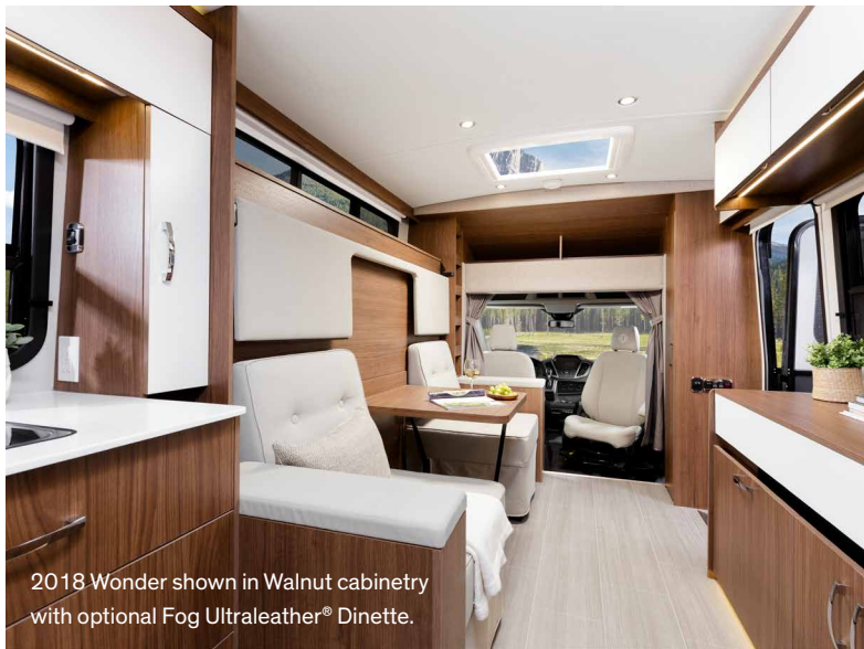
2018 Wonder shown in Walnut cabinetry with optional Fog Ultraleather® Dinette.