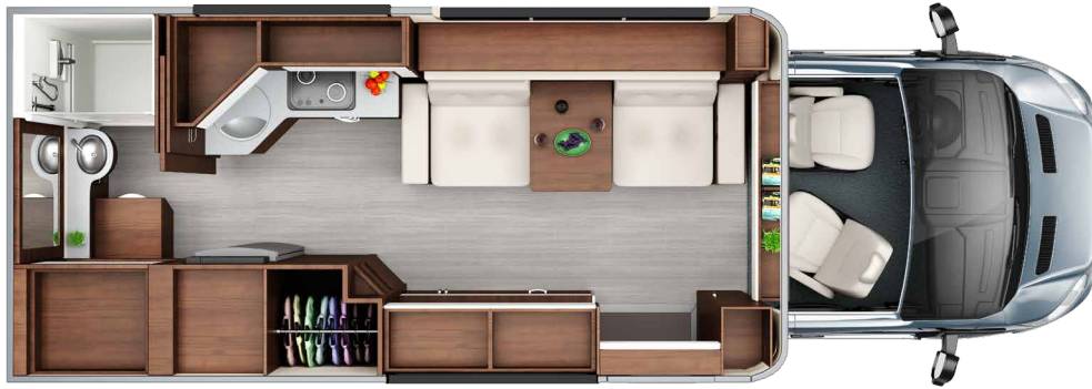
W24MB | Murphy Bed