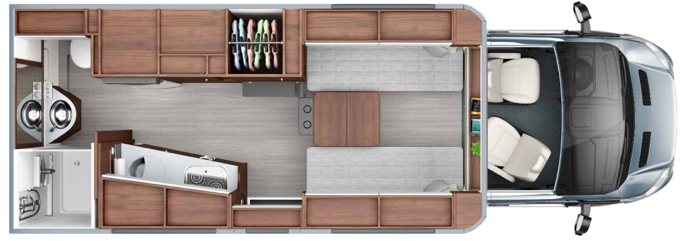
W24FTB | Front Twin Bed