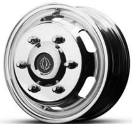
Alcoa Dura-Bright® Aluminum Wheels All 6 Aluminum Wheels, 4 Dura-Bright® Wheels