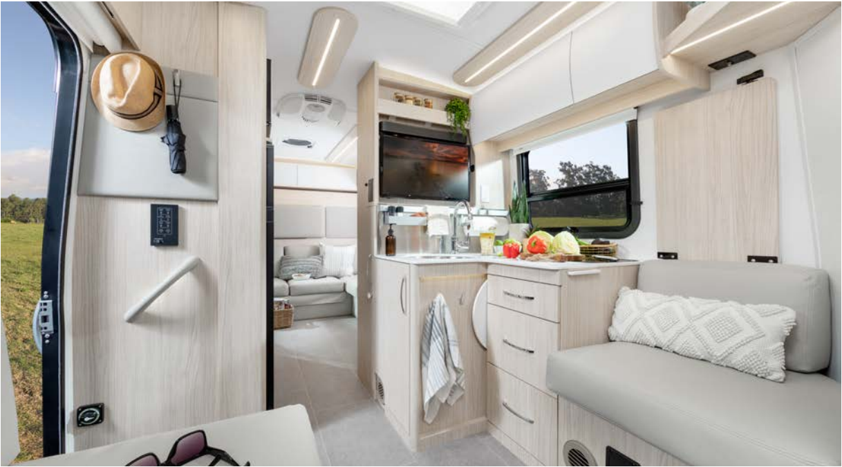
White Oak shown with Bianco White FENIX® Cabinetry Upgrade