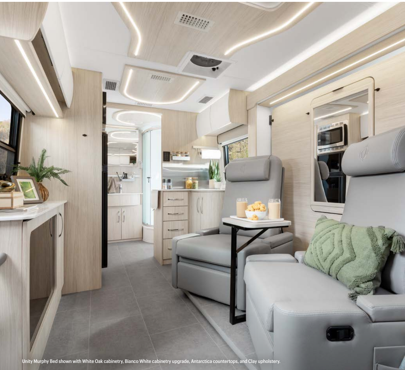
Unity Murphy Bed shown with White Oak cabinetry, Bianco White cabinetry upgrade, Antarctica countertops, and Clay upholstery.