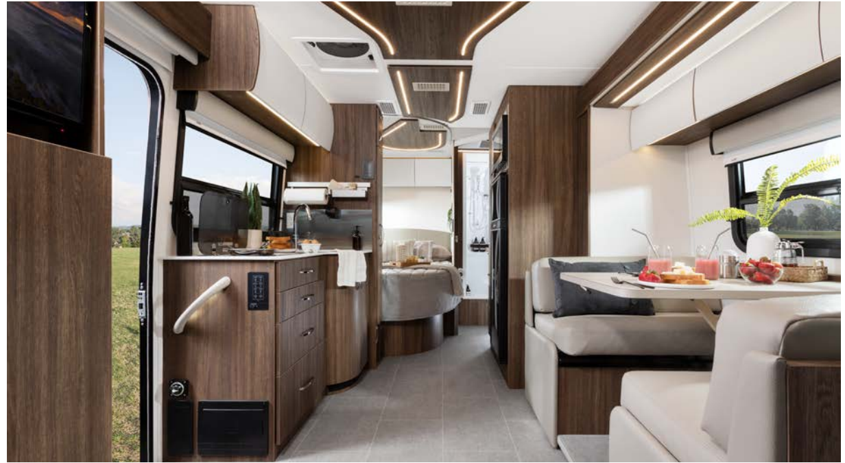
Mocha shown with Bianco White FENIX® Cabinetry Upgrade