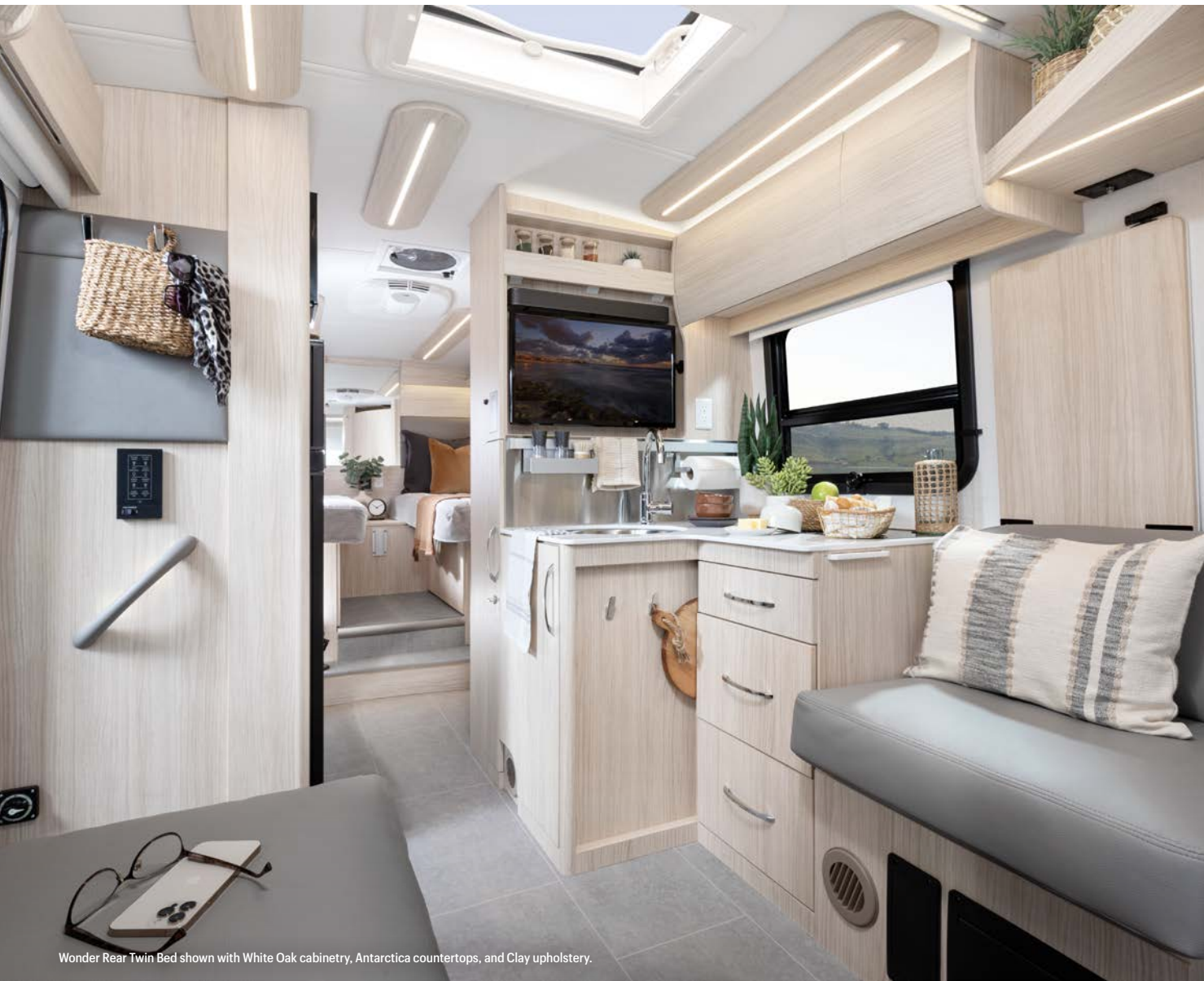
Wonder Rear Twin Bed shown with White Oak cabinetry, Antarctica countertops, and Clay upholstery.