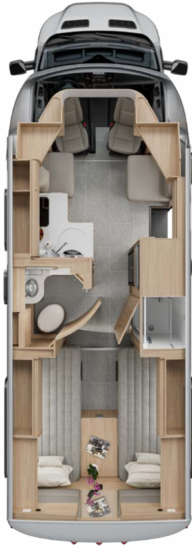
Rear Twin Bed | W24RTB