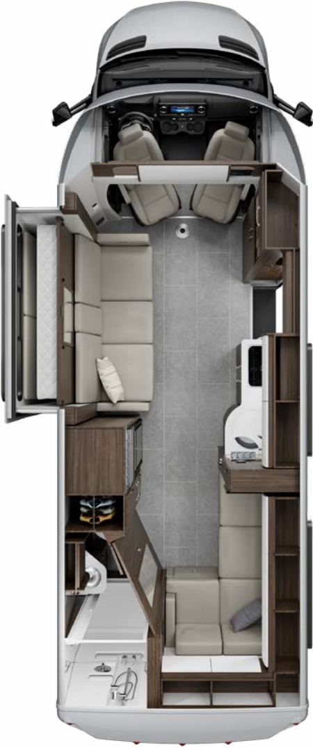
FX | U24FX