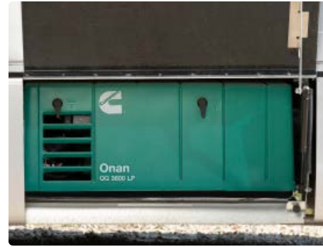
3.6 kW LP Generator With Auto Start and Auto Changeover Switch