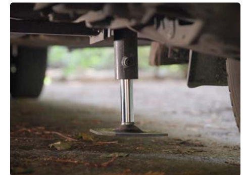
4-Point Self-Leveling Jacks