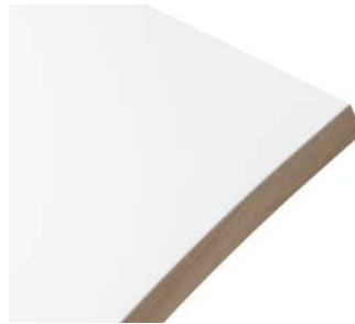
Bianco White FENIX®