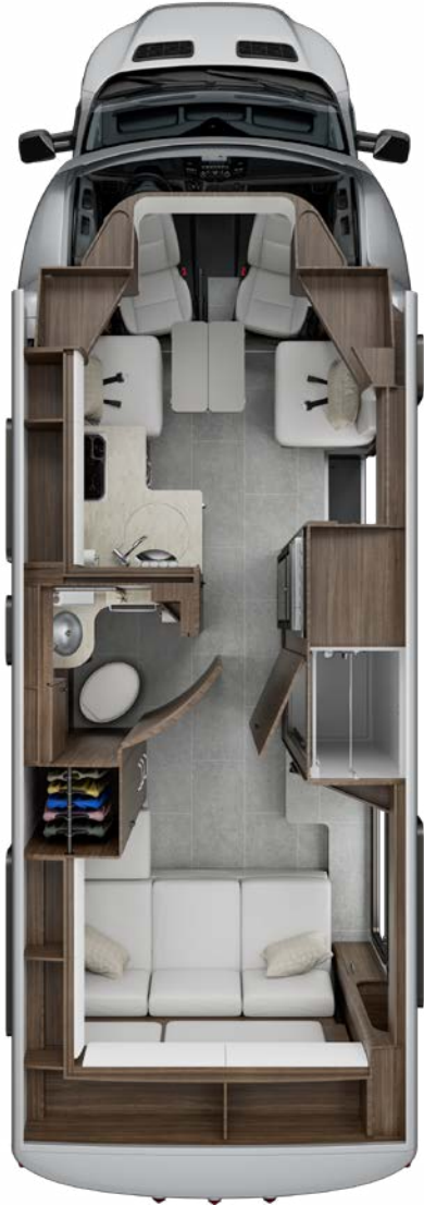
Rear Lounge | W24RL