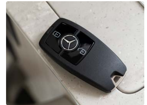
Remote Key Fob Entry Coach Entrance Door