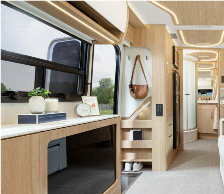
Rift Oak shown with Bianco White FENIX® Cabinetry Upgrade