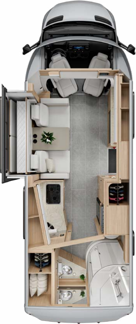
Murphy Bed Lounge | U24MBL