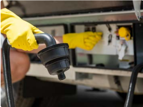
Macerator Sewage Discharge With Manual Disconnect