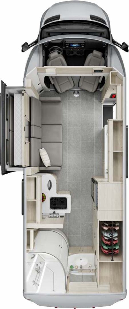
Murphy Bed | U24MB (Shown with standard Leisure Lounge)