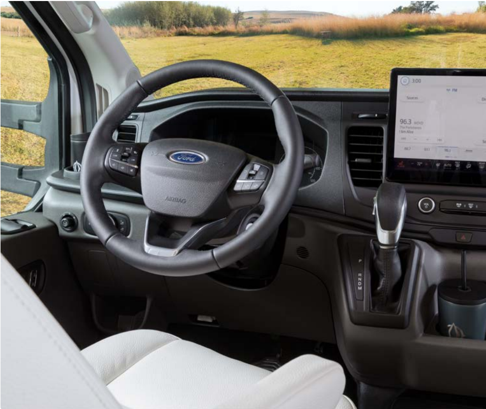
Ford Transit Chassis with Intelligent All-Wheel Drive