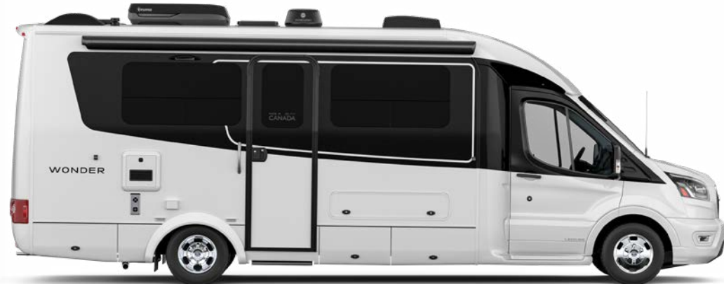
Wheelbase: 178" (4,522 mm)