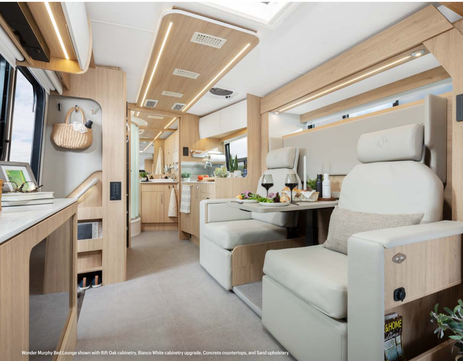
Wonder Murphy Bed Lounge shown with Rift Oak cabinetry, Bianco White cabinetry upgrade, Concrete countertops, and Sand upholstery.