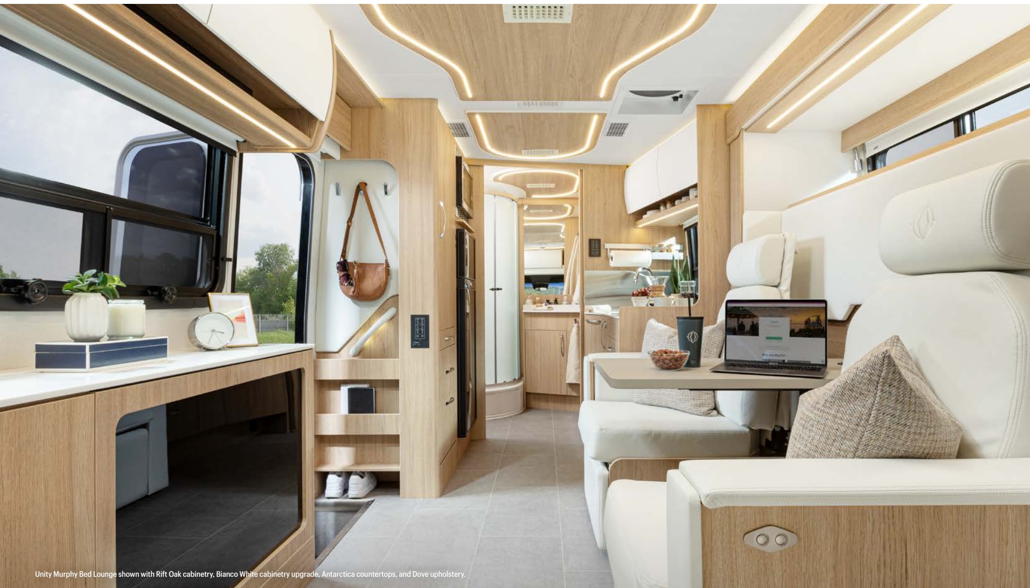
Unity Murphy Bed Lounge shown with Rift Oak cabinetry, Bianco White cabinetry upgrade, Antarctica countertops, and Dove upholstery.