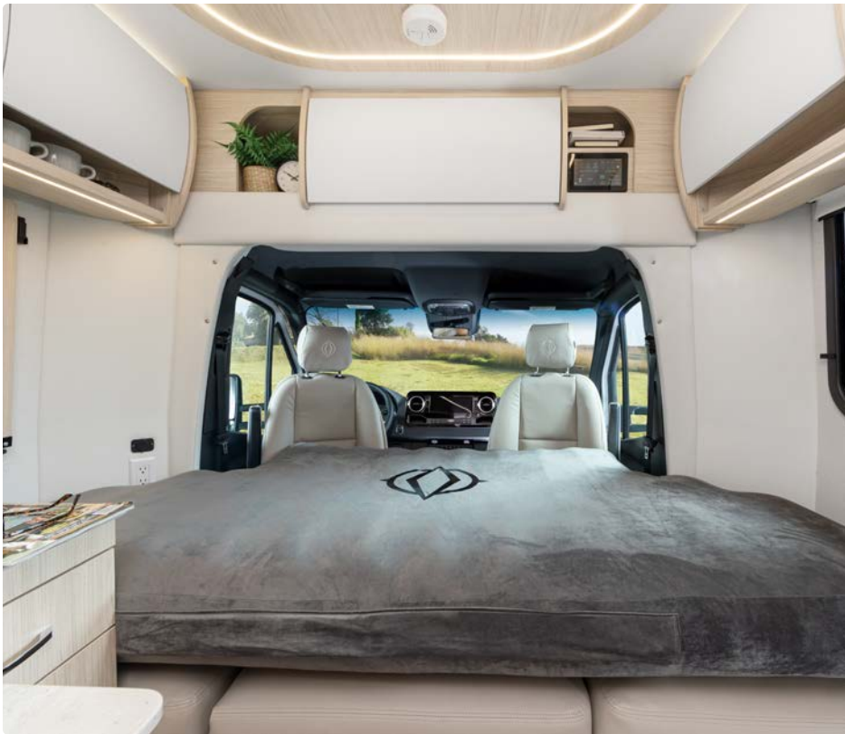
Inflatable Bed for Front Dinette 45" x 88" Sleeping Area (RL, TB)