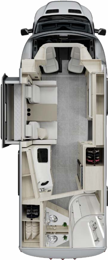
Murphy Bed Lounge | W24MBL