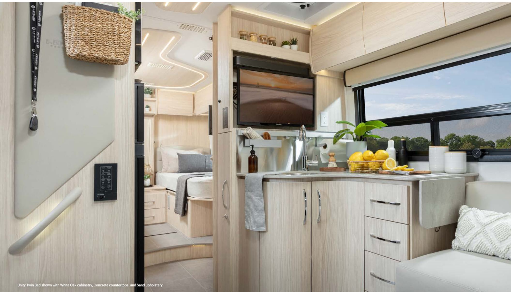
Unity Twin Bed shown with White Oak cabinetry, Concrete countertops, and Sand upholstery.