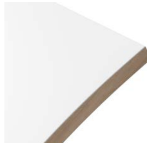
Bianco White FENIX®