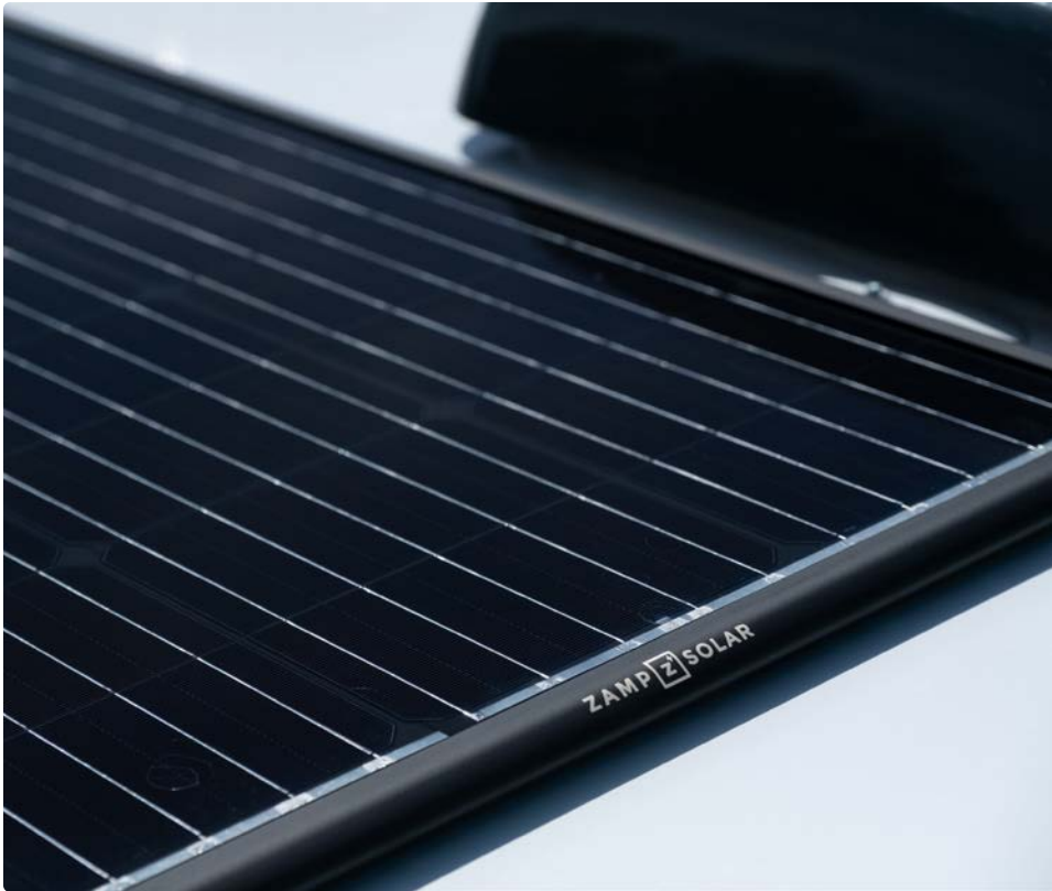
Rigid Solar Panels with Control Panel 200 W or 400 W