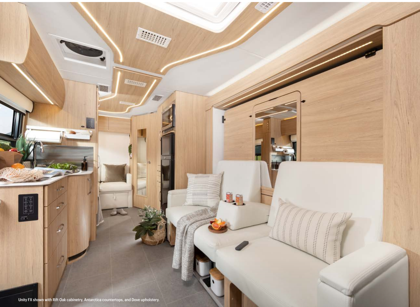
Unity FX shown with Rift Oak cabinetry, Antarctica countertops, and Dove upholstery.