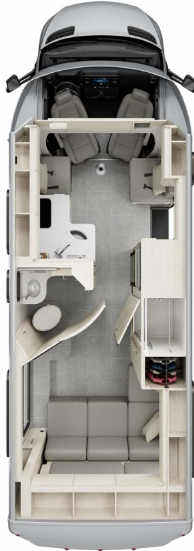
Rear Lounge | U24RL