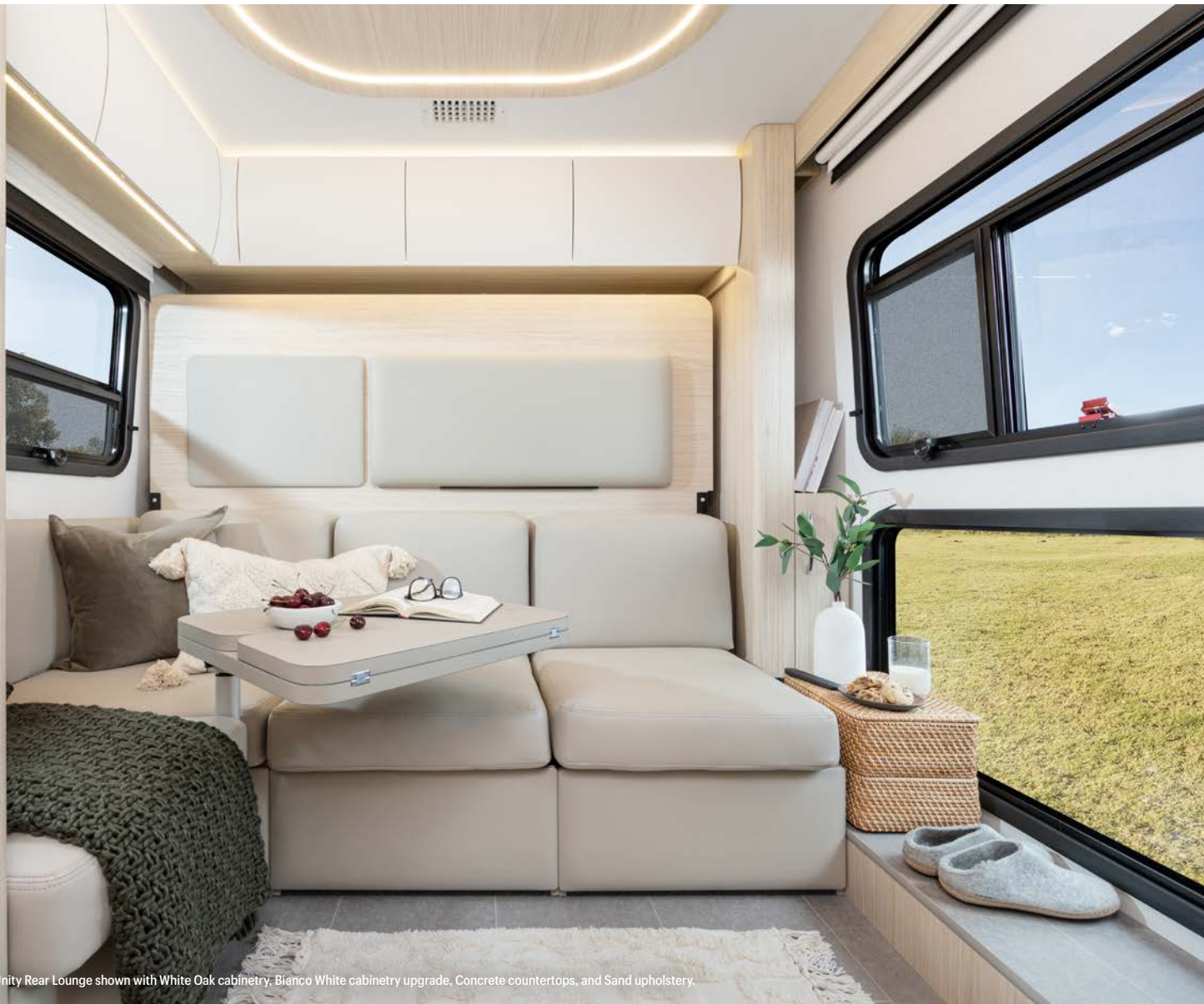
Unity Rear Lounge shown with White Oak cabinetry, Bianco White cabinetry upgrade, Concrete countertops, and Sand upholstery.