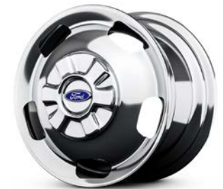
Aluminum Alloy Wheels Standard