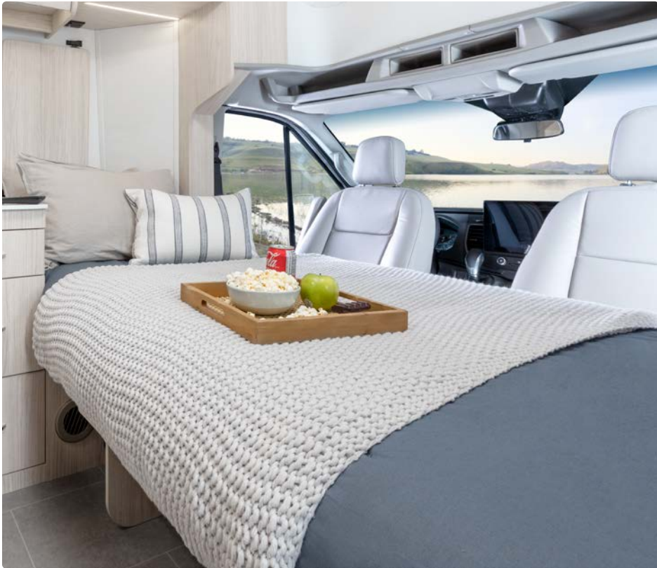
Inflatable Bed for Front Dinette 45" x 88" Sleeping Area (RL, RTB)