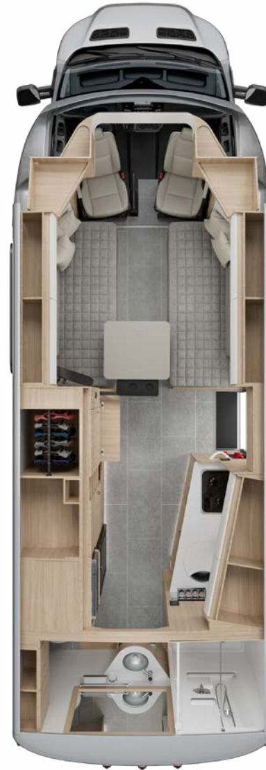
Front Twin Bed | W24FTB