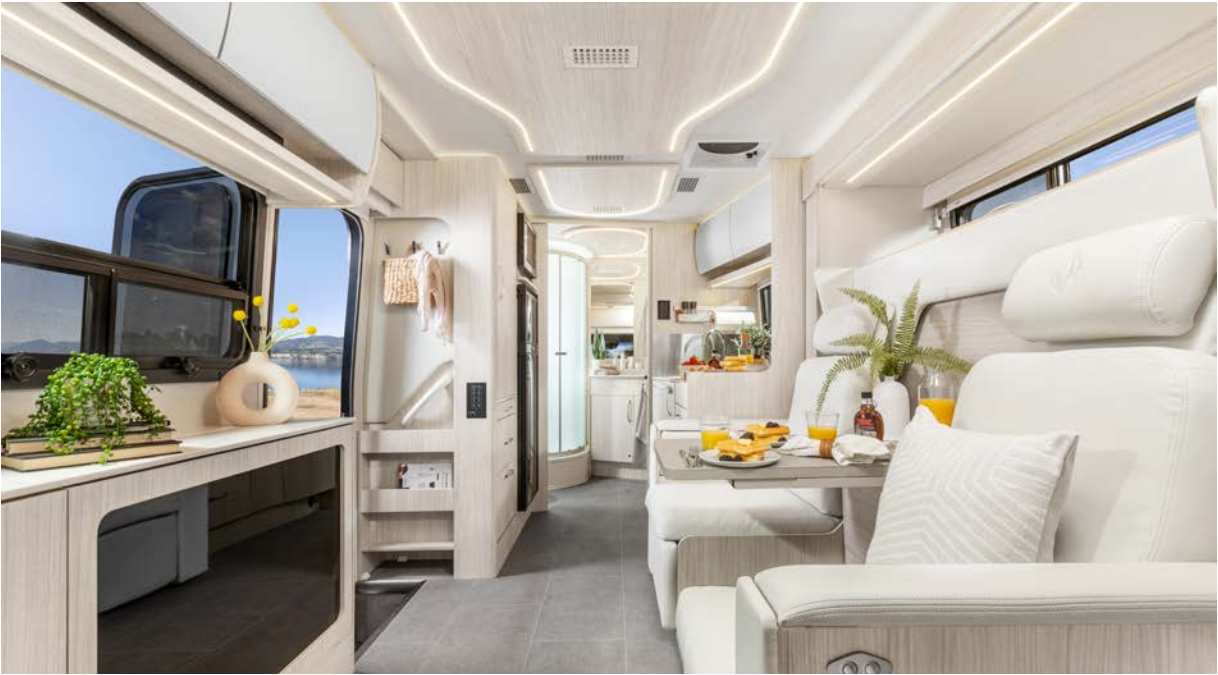
White Oak shown with Bianco White FENIX® Cabinetry Upgrade