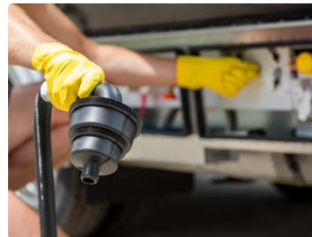
Macerator Sewage Discharge With Manual Disconnect