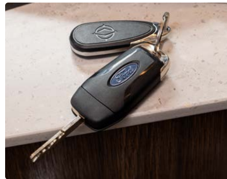
Keyless Entrance Door