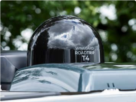
Auto-Acquisition Satellite Dish