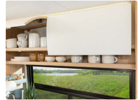
Cabinetry Upgrade FENIX® Matte Overhead Cabinet Doors