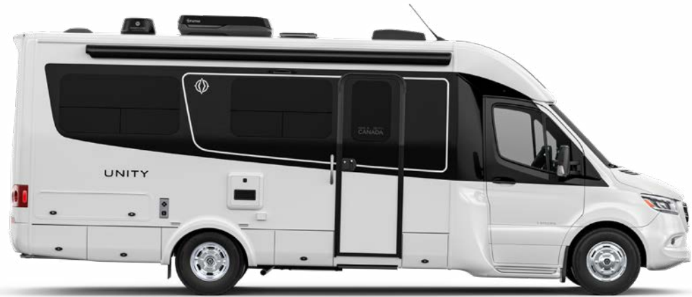
Wheelbase: 170" (4,326 mm)