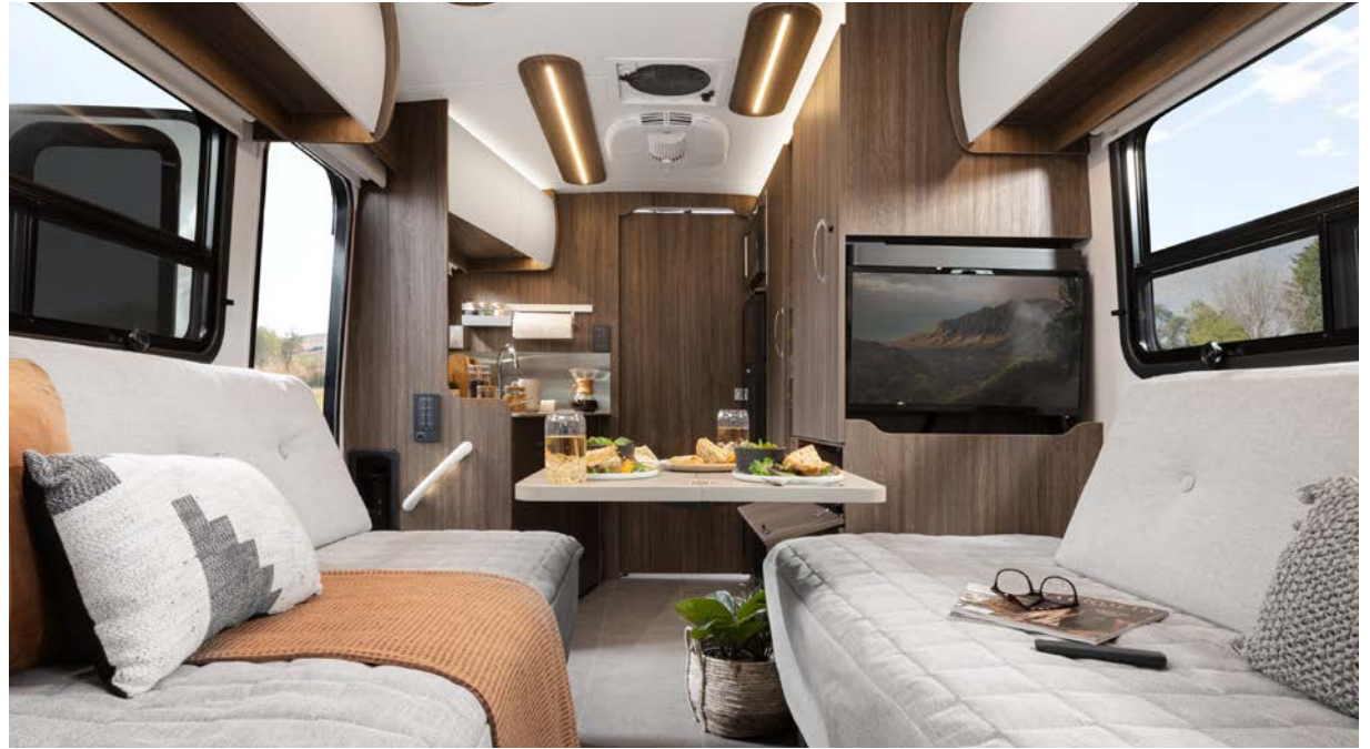
Mocha shown with Bianco White FENIX® Cabinetry Upgrade