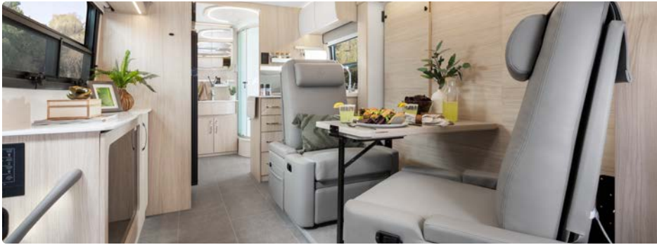
Leisure Lounge System Plus Dinette System 2 Ultrafabrics® Rotating Power Recliners (MB)