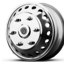
Standard Steel Wheels With Wheel Simulators