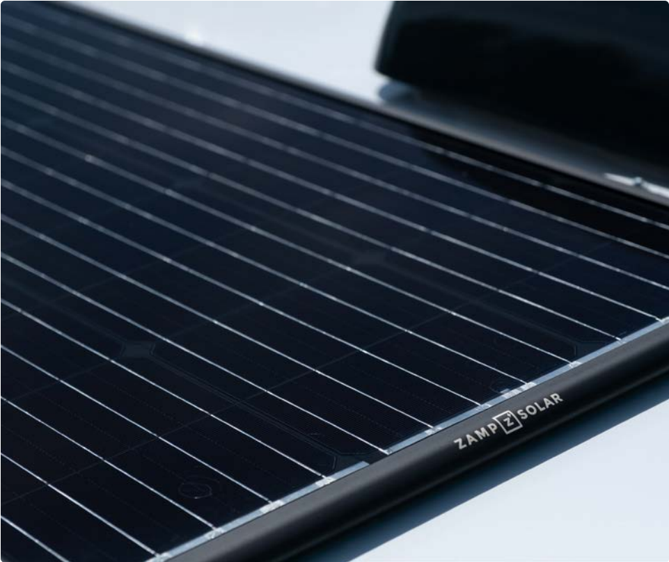
Rigid Solar Panels with Control Panel 200 W or 400 W