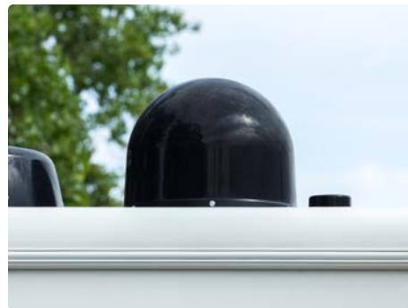
Auto-Acquisition Satellite Dish