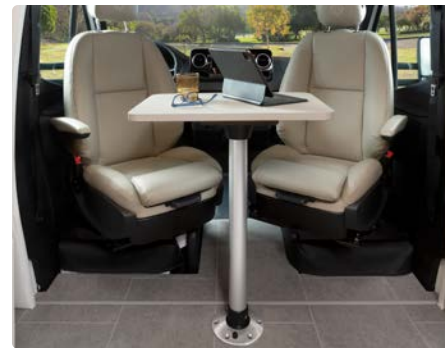
Removable Front Table Between Captain Chairs (MBL, MB, FX, CB)