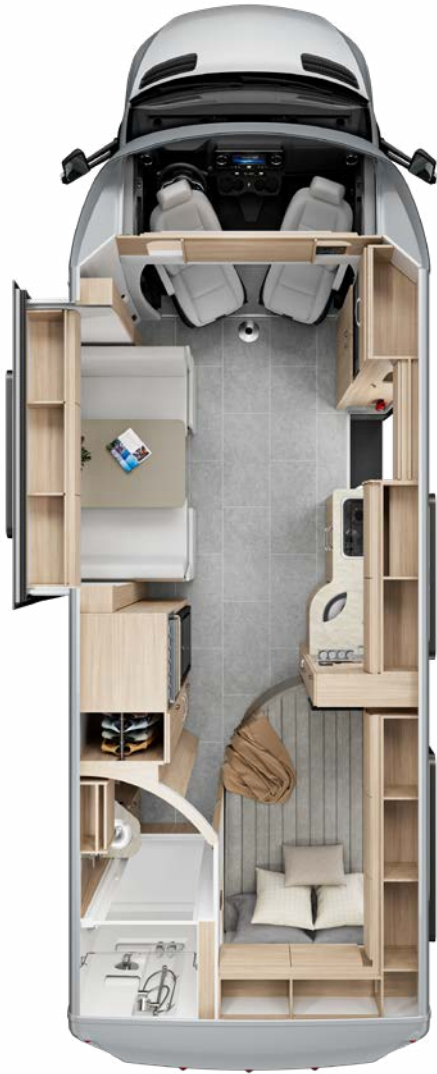
Corner Bed | U24CB (Shown with Standard Dinette)