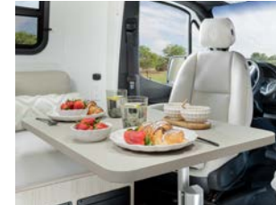
Table Mount System

The 2000-W Pure Sine Wave Inverter provides plenty of capacity for running your 120-V devices, as well as an inverted microwave plug.