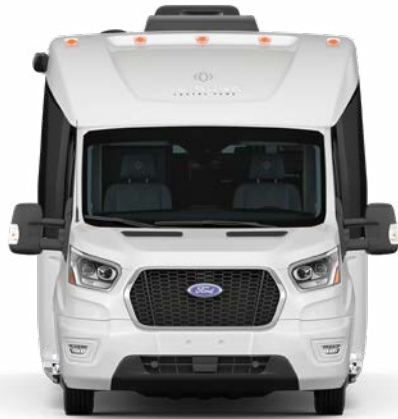
Width: 7' 11" (2,416mm)