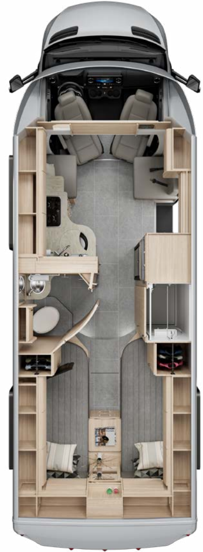
Twin Bed | U24TB