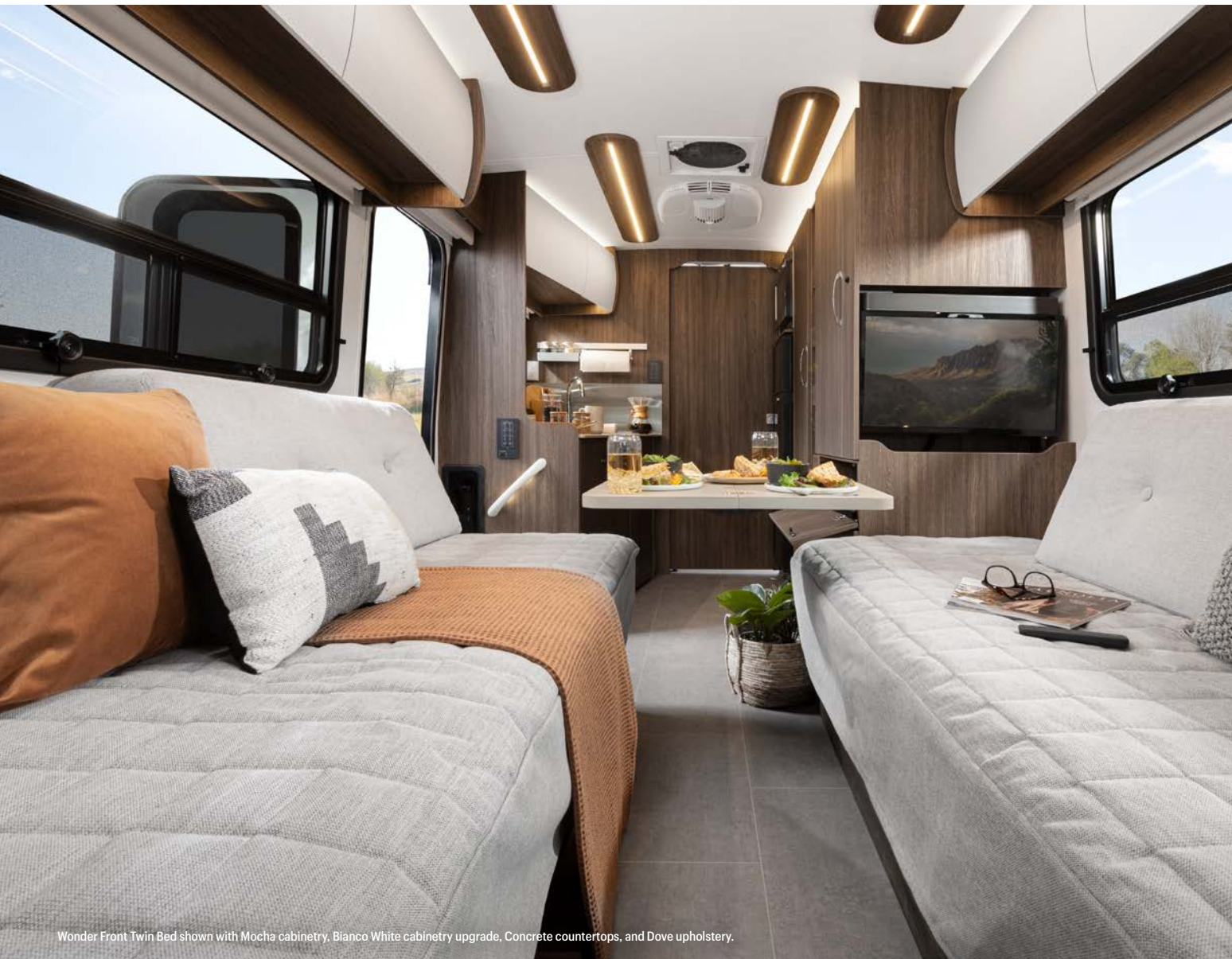
Wonder Front Twin Bed shown with Mocha cabinetry, Bianco White cabinetry upgrade, Concrete countertops, and Dove upholstery.