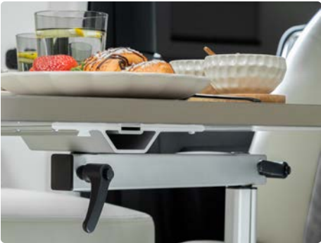
Removable Front Table Between Captain's Chairs (MBL)