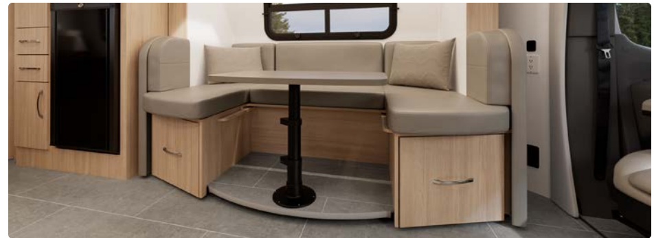
U-Lounge Dinette with Easy Lift Table Ultrafabrics® 40" x 69" Sleeping Area (CB)