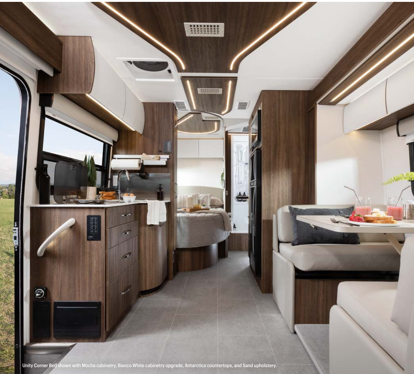
Unity Corner Bed shown with Mocha cabinetry, Bianco White cabinetry upgrade, Antarctica countertops, and Sand upholstery.