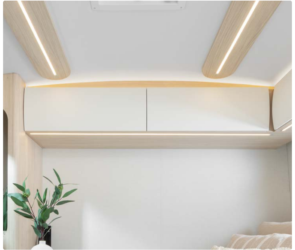
Cabinetry Upgrade FENIX® Matte Overhead Cabinet Doors