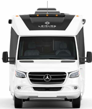
Width: 7' 11" (2,416 mm)